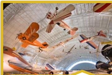
Smithsonian Museums: - Air & Space - Museum of American History