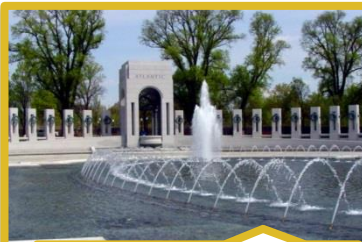
National World War II Memorial

CLICK HERE TO VIEW FREE ACTIVITIES FOR FAMILIES!